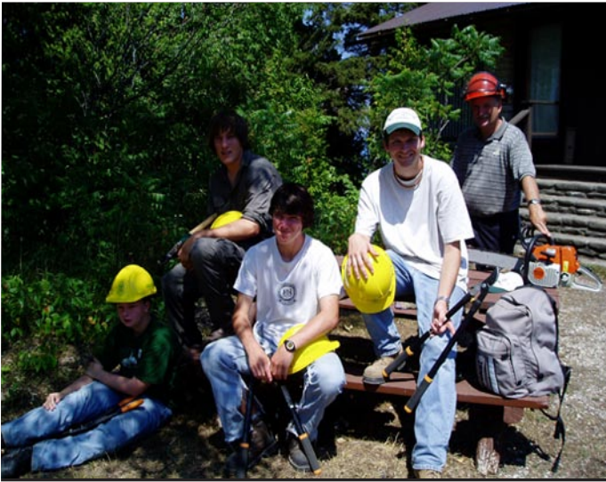
The summer '06 OSR crew enjoying a much deserved break in front of Grebe Lodge.

On July 24 and 25 the Ontario Stewardship Ranger crew for the Grey-Bruce area worked on road brushing at BPBO. To save on travel time from Owen Sound, the crew stayed over at Grebe Lodge the first night. Bob Lesperance from Ontario Parks supplied the hand tools, and did chainsaw work on the larger problem trees along the road edge. The objective was to improve vision lines along the road for safety, and to protect vehicles from being scratched by branches.