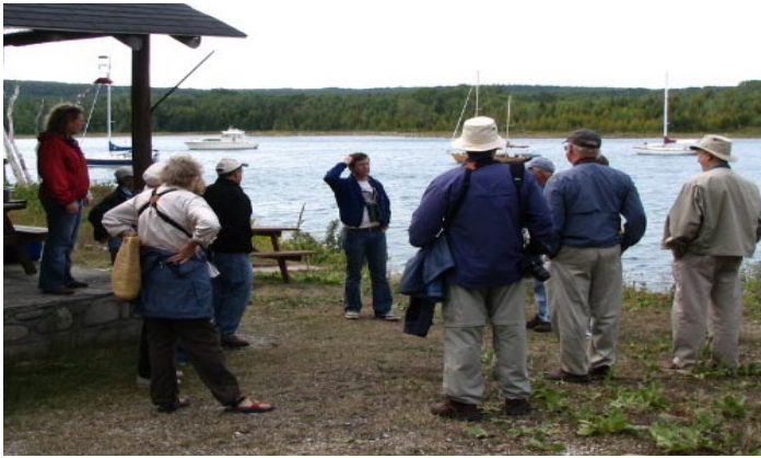
The leader of the bird hike at the August Open House making an eloquent gesture (which translates, "Where's all the birds? Gee, I dunno.")

(continued from p.1) appreciate the sense of continuity that his extended tenure brings to BPBO. Here follow some late-breaking news items from the station: